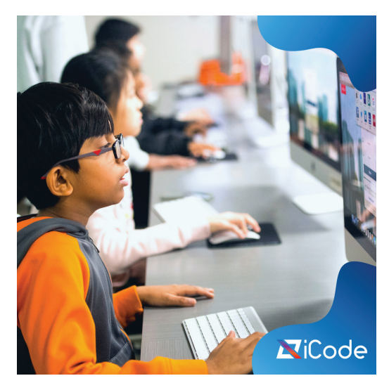
Students learn in person at the iCode school in Troy.

make for a strong, all-encompassing educational environment and a thriving talent pool for local businesses.